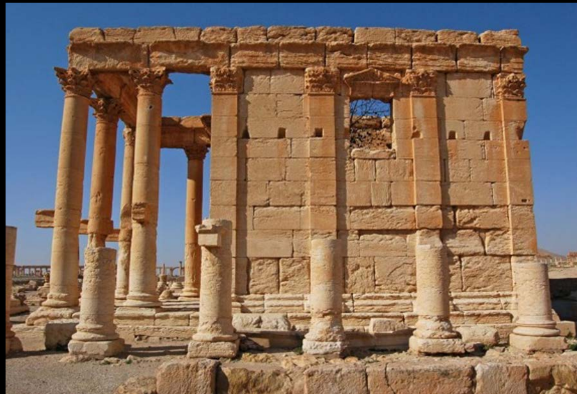
Palmyra - Temple of Baal Shamin. March 2007. Ross Burns/Manar al-Athar [142035].

More images before the destruction Palmyra - Temple of Baal Shamin