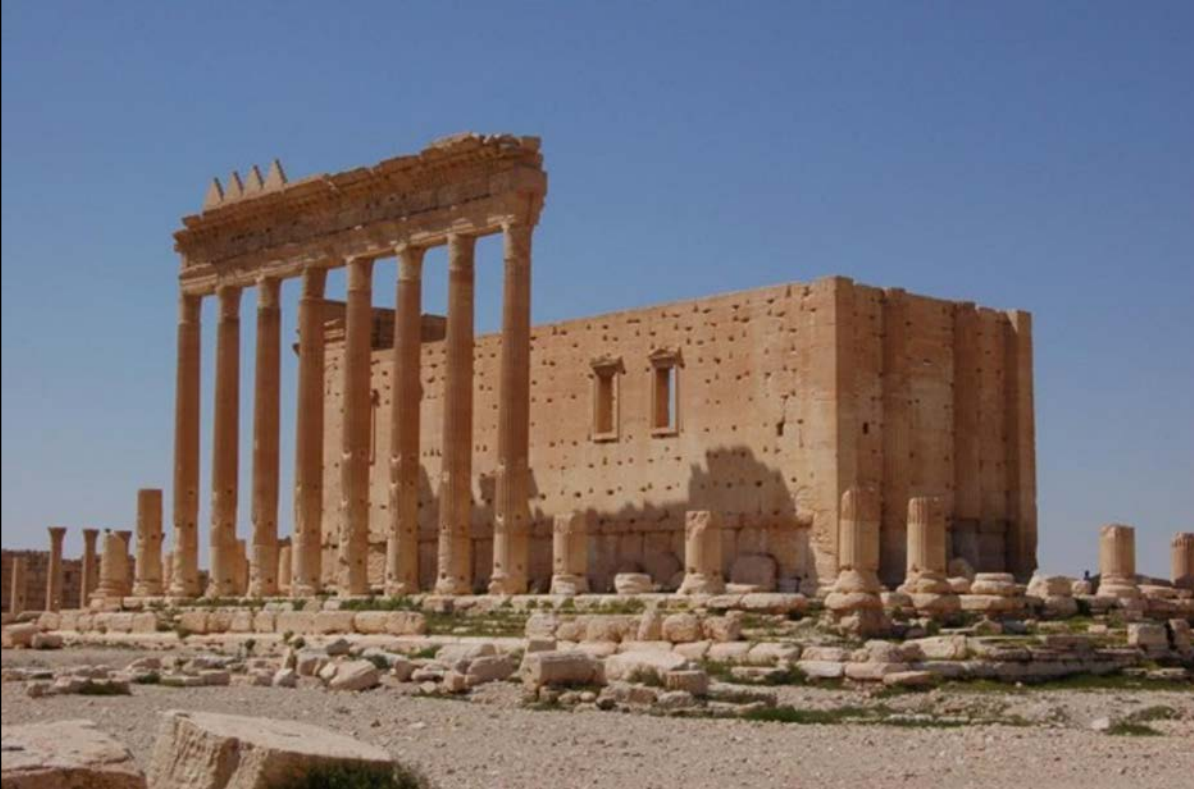
Palmyra - Temple of Bel. March 2007.