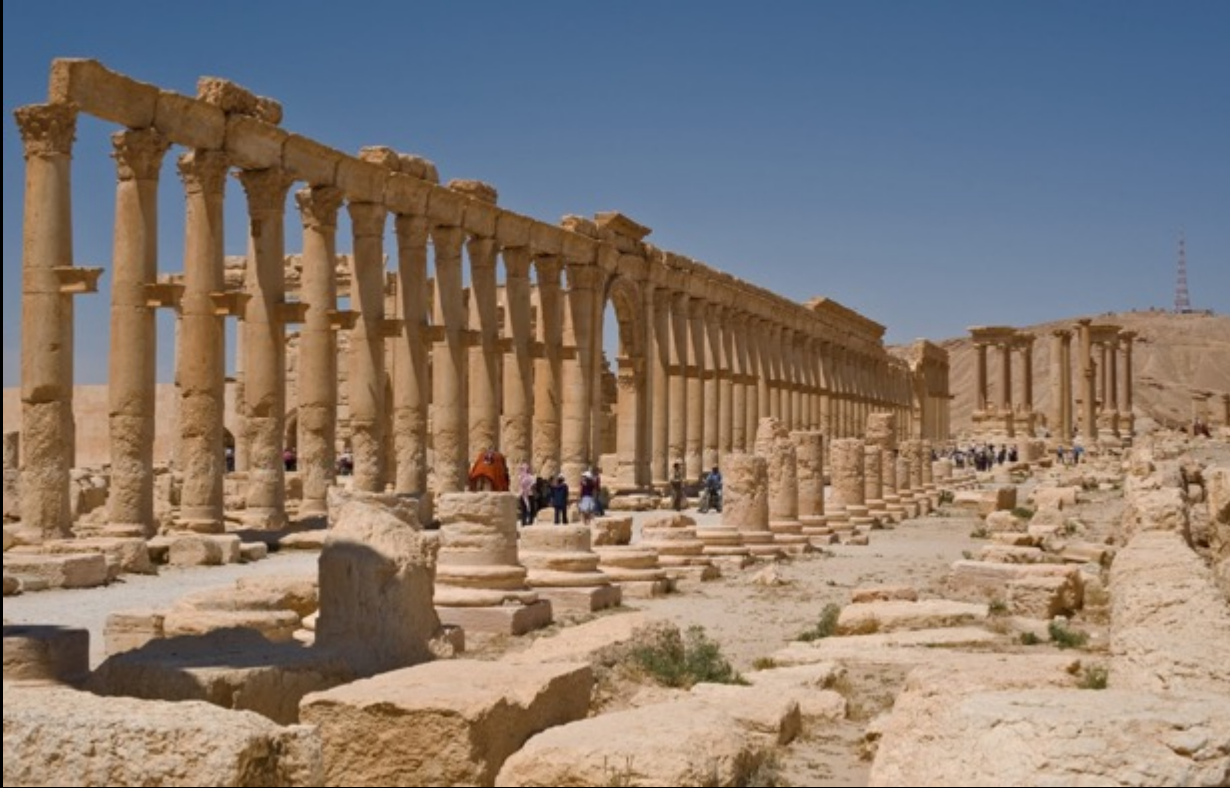
Palmyra - colonnaded streets - Great Colonnade - sector B. April 2010. [ID 101410]