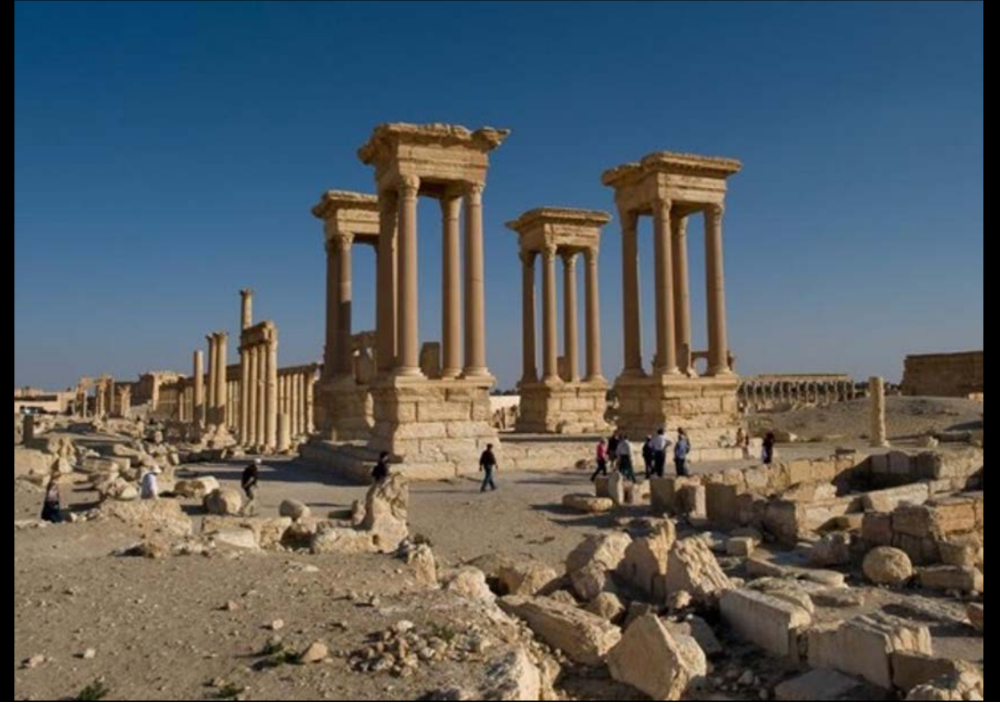
Palmyra – Tetrapylon. March 2011. Destroyed 2017.