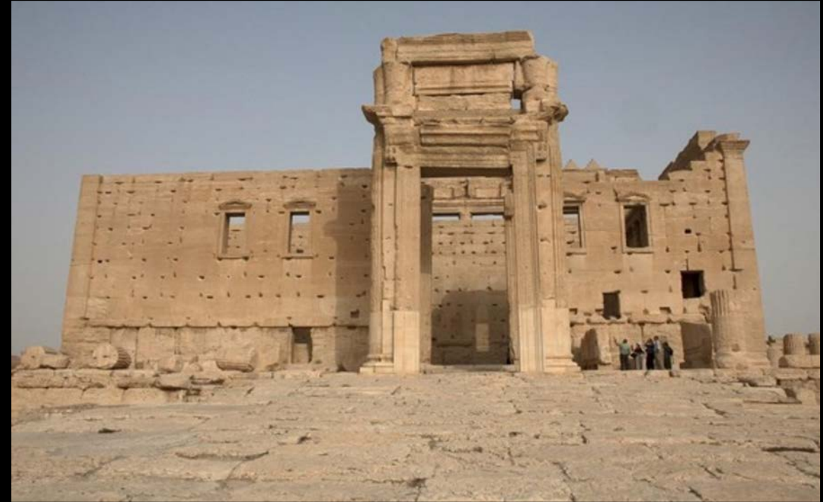
Palmyra - Temple of Bel. September 2010.