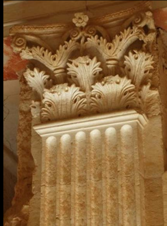
Palmyra – Tower Tomb of Elahbel. December 2005.