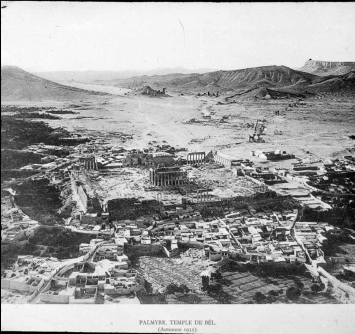
Palmyra - Temple of Bel. Autumn 1932.