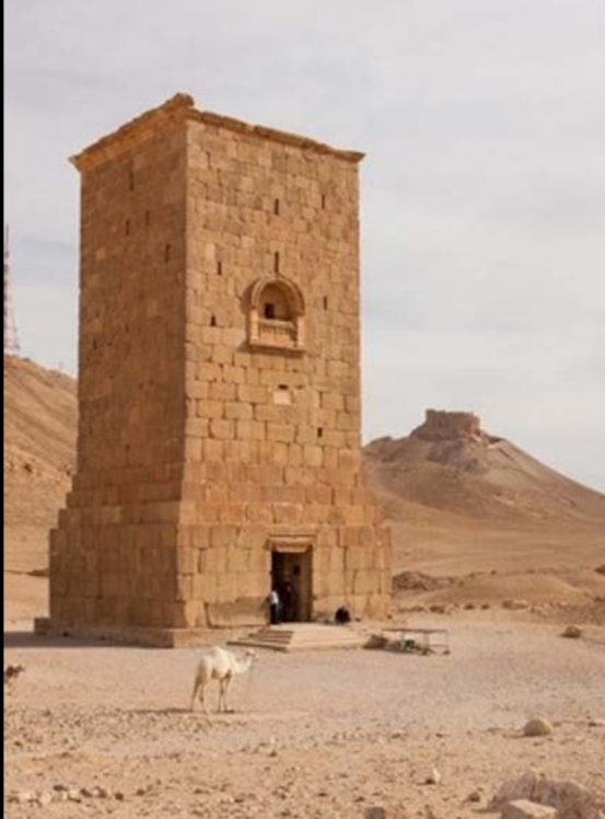
Palmyra – Tower Tomb of Elahbel. April 2009.