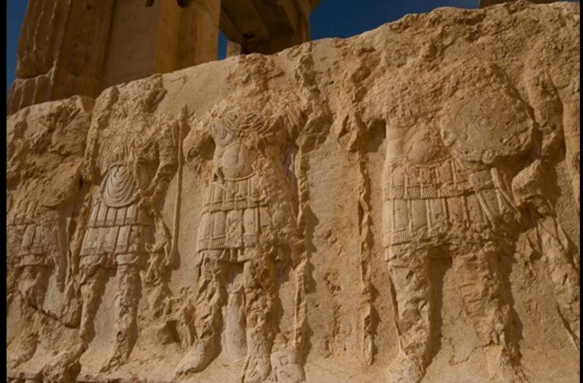
Palmyra - Temple of Bel. March 2011. Ross Burns/Manar al-Athar [ID 99613]