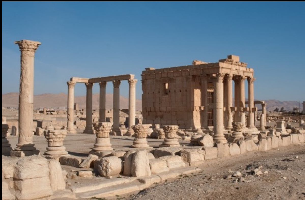
Palmyra - Temple of Baal Shamin - southwest courtyard. [ID 100521]