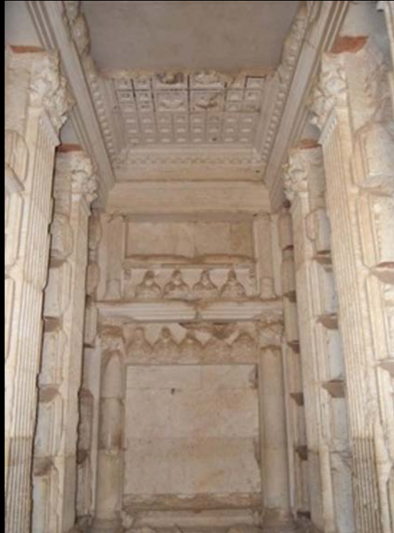
Palmyra – Tower Tomb of Elahbel. September 2010.