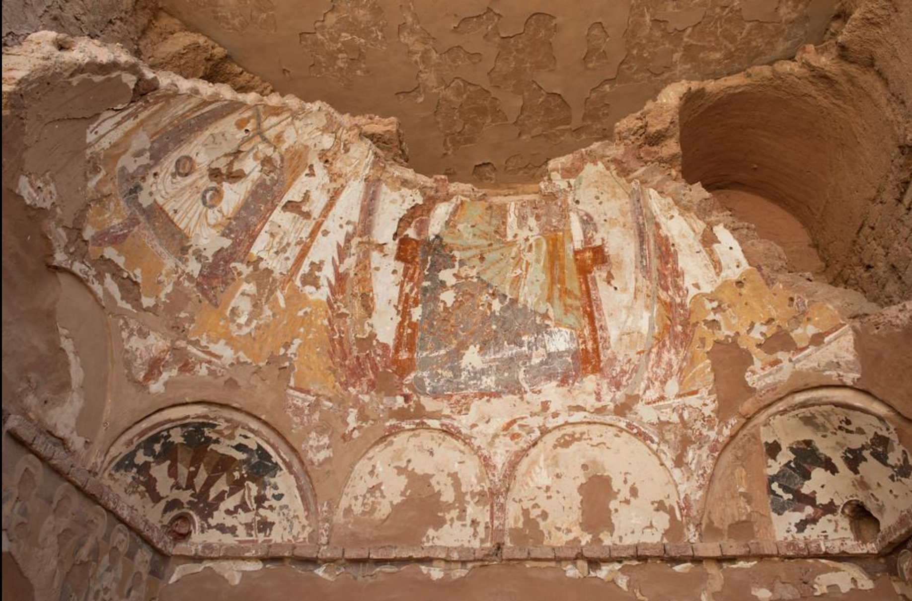
Aswan - Monastery of St Simeon – church, apse, wall painting (2015). Ross Burns/Manar al-Athar [ID 62485]