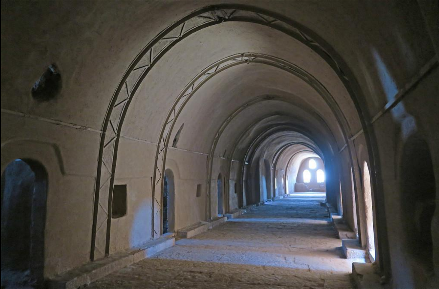
Aswan - Monastery of St Simeon - upper level. Ross Burns/Manar al-Athar [ID 62509]