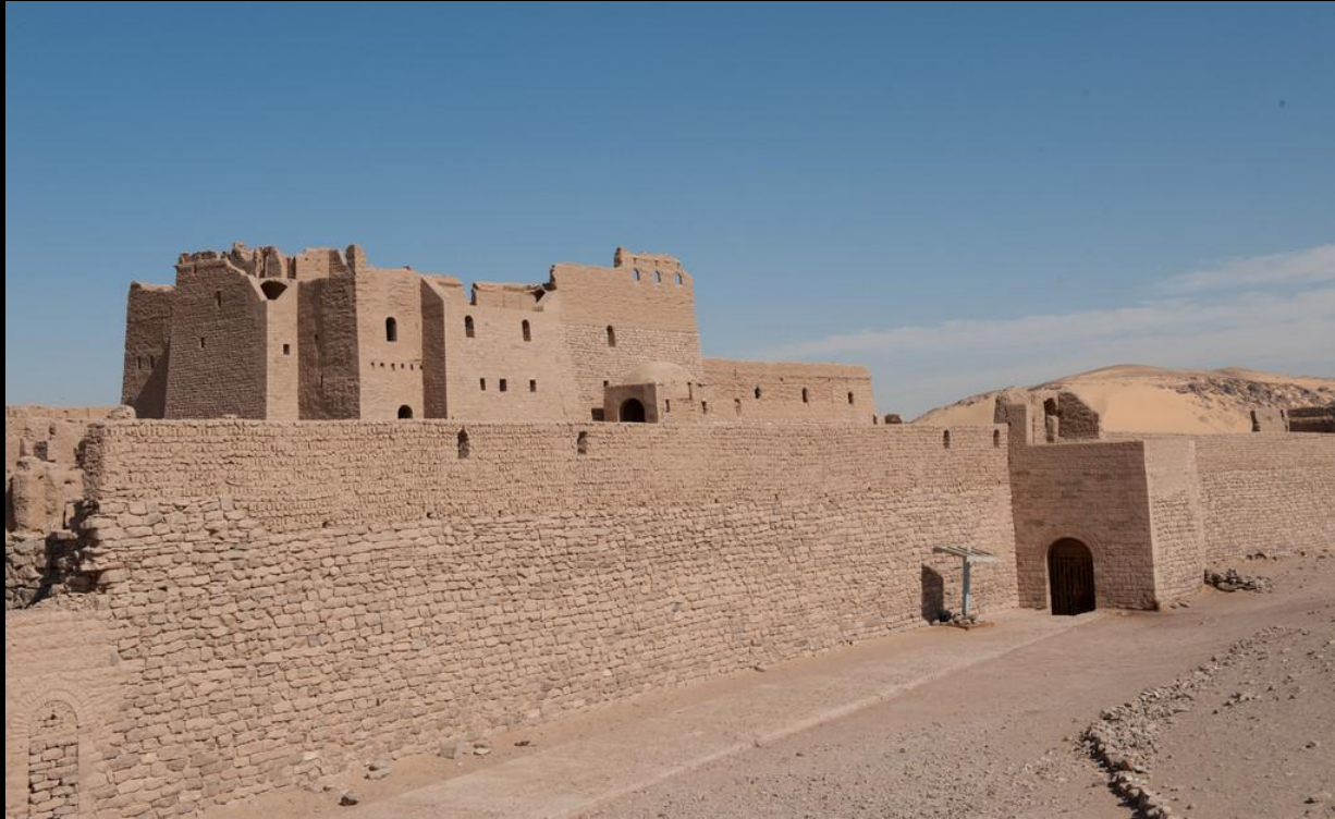
Aswan - Monastery of St Simeon - east wall. Ross Burns/Manar al-Athar [ID 62466]