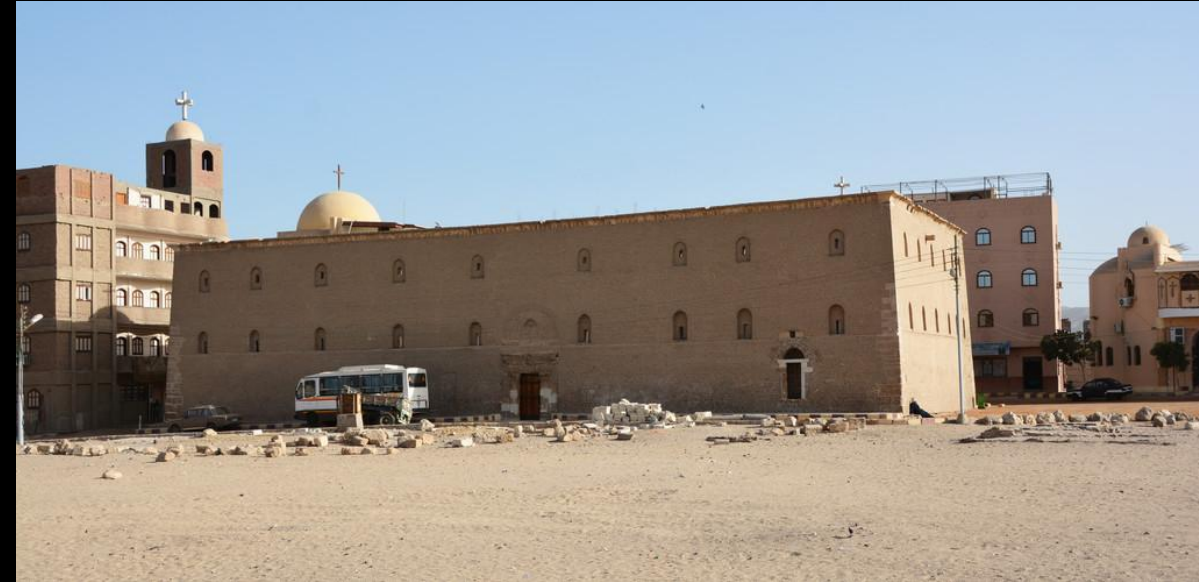
Sohag - Monastery of Apa Bishuy (Red Monastery) - facing southeast.