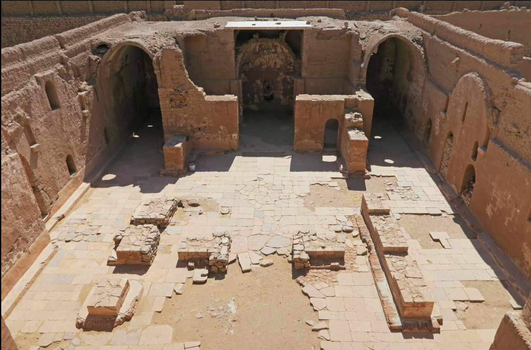
Aswan - Monastery of St Simeon - church - facing east. [ID 62477]