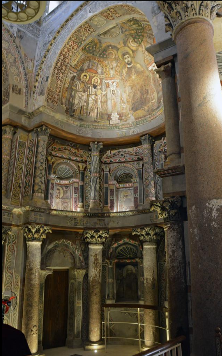
Sohag - Monastery of Apa Bishuy (Red Monastery) -south apse.