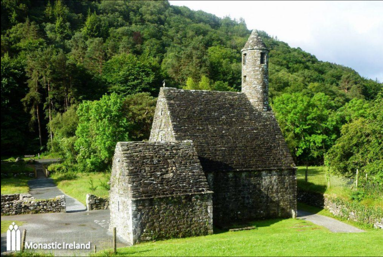
Monastic Ireland. "Glendalough – St. Kevin's church." http://monastic.ie/history/glendalough/