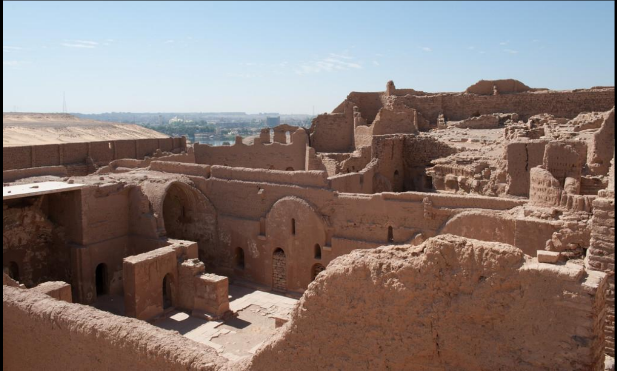
Aswan - Monastery of St Simeon – church – facing southeast.