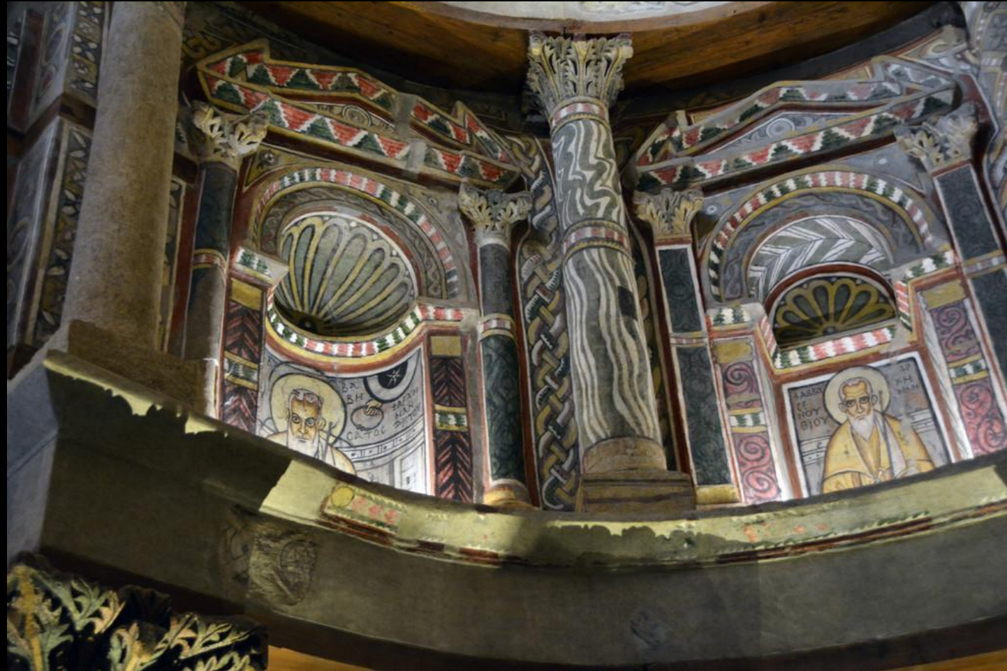
Sohag - Monastery of Apa Bishuy (Red Monastery) -north apse. Mohamed Kenawi/Manar al-Athar [ID 65356]