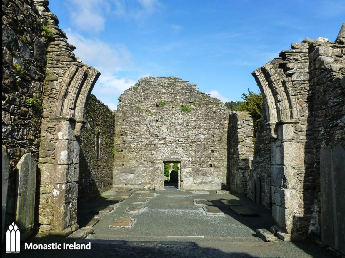
Monastic Ireland. "Glendalough – Cathedral." http://monastic.ie/history/glendalough/