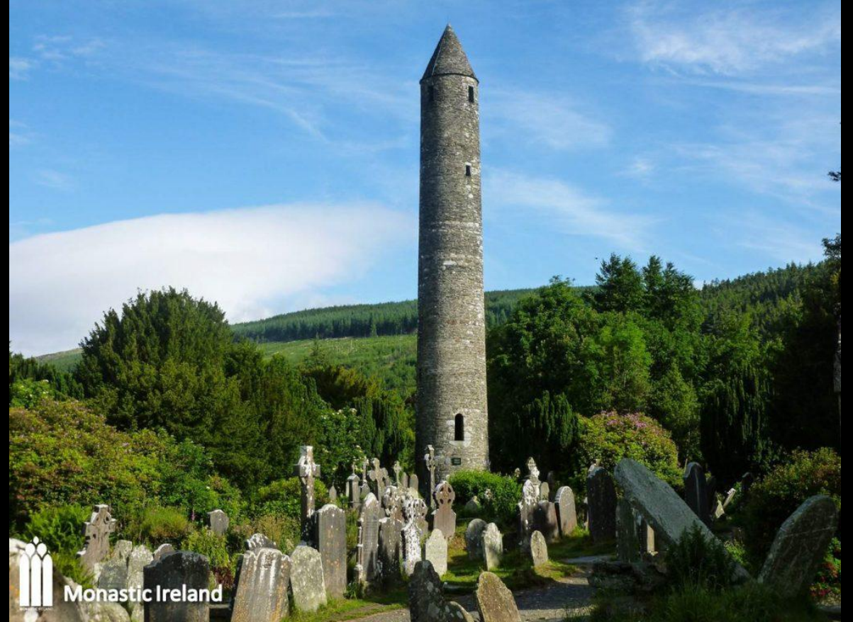
Monastic Ireland. "Glendalough – Round Tower." http://monastic.ie/history/glendalough/