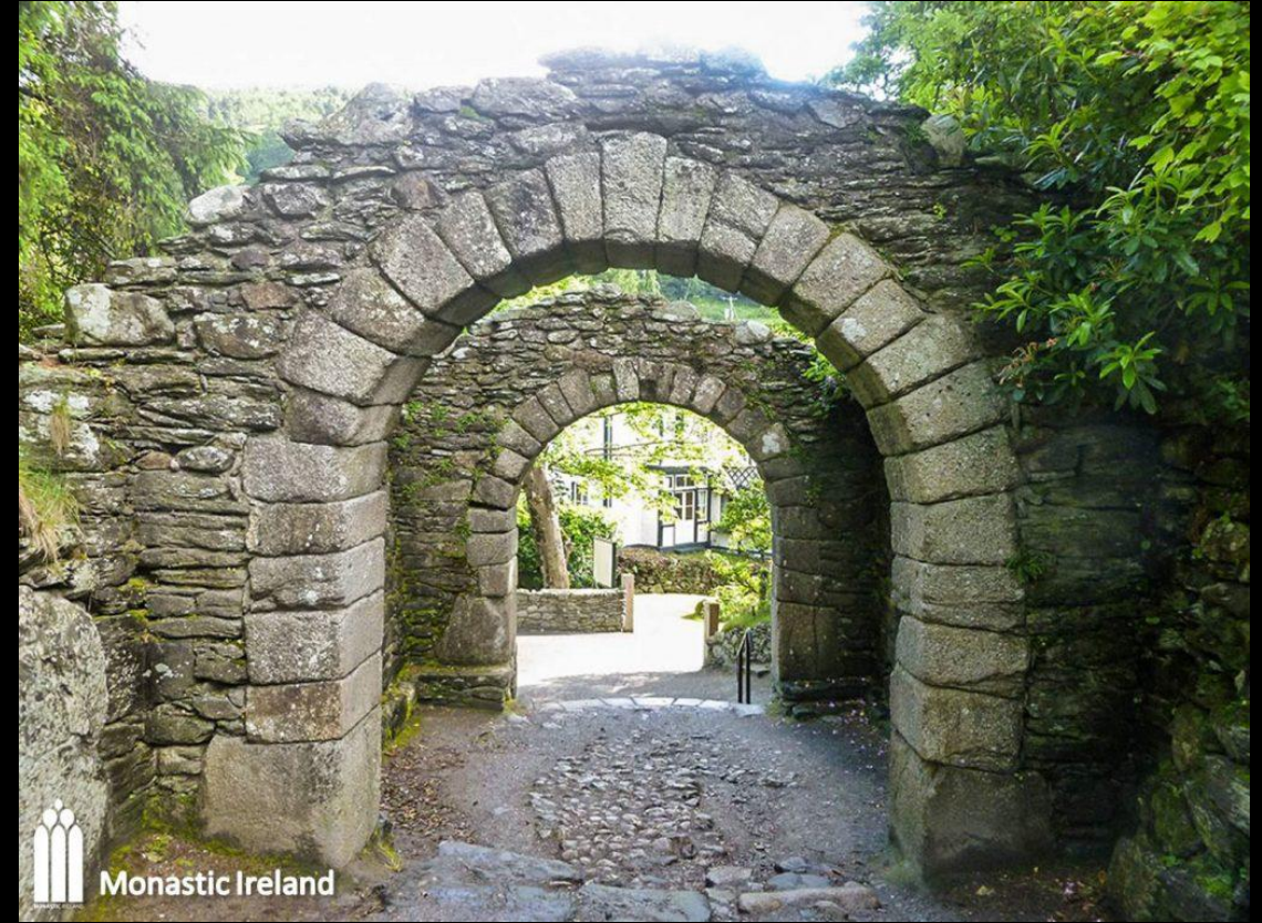
Monastic Ireland. "Glendalough – Gateway." http://monastic.ie/history/glendalough/