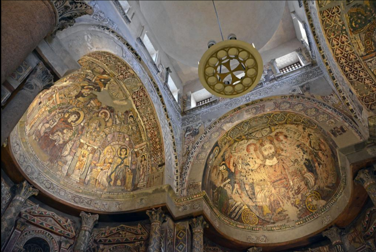
Sohag - Monastery of Apa Bishuy (Red Monastery) - north apse and east apse. [ID 65339]