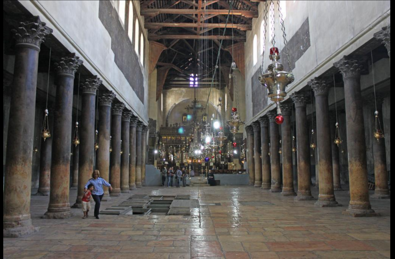
Bethlehem - Church of the Nativity - nave looking east. Sean Leatherbury/Manar al-Athar [ID 72506]