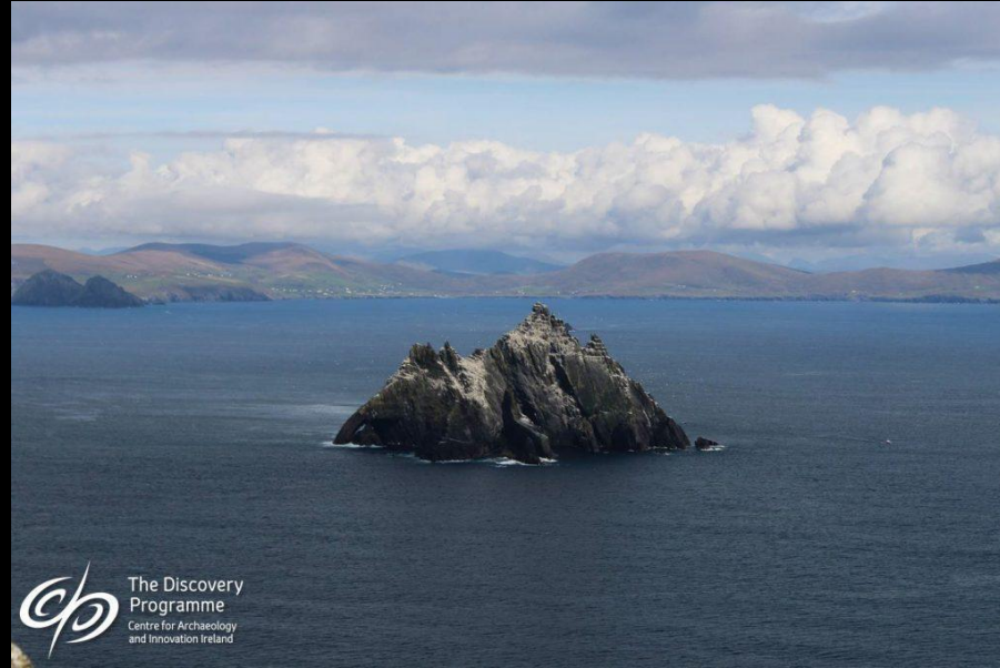
Monastic Ireland. "Skellig Michael."