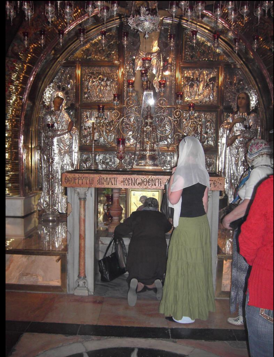
Jerusalem - Church of the Holy Sepulchre - Calvary - facing east. [ID 49639]