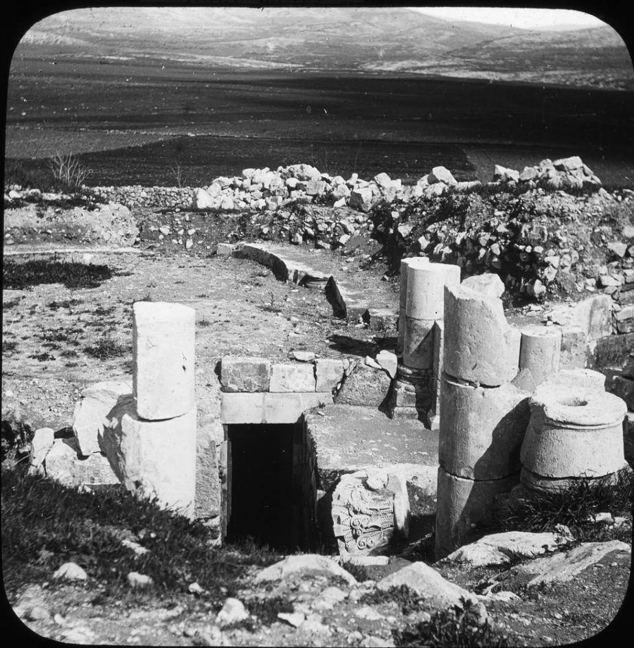
Jacob's Well or Well of Sychar, Palestine, West Bank. Early 20 th century (?)

” So he came to a town in Samaria called Sychar, near the plot of ground Jacob had given to his son Joseph. Jacob's well was there, and Jesus, tired as he was from the journey, sat down by the well. It was about noon.