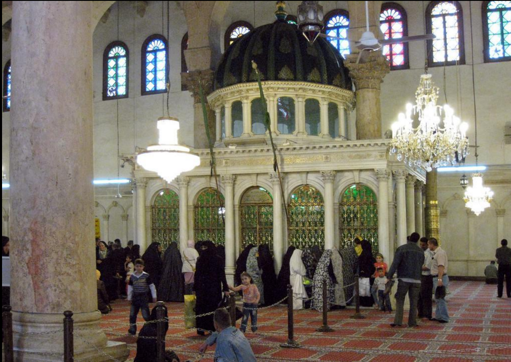
Damascus - Umayyad (Great) Mosque - prayer hall - shrine of St John the Baptist.