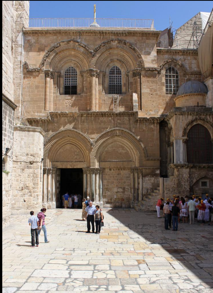
Jerusalem - Church of the Holy Sepulchre - forecourt (parvis) - facing north. Sean Leatherbury/Manar al-Athar [ID 72599]