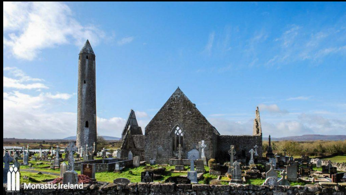
Killone Augustinian Abbey (Nunnery)