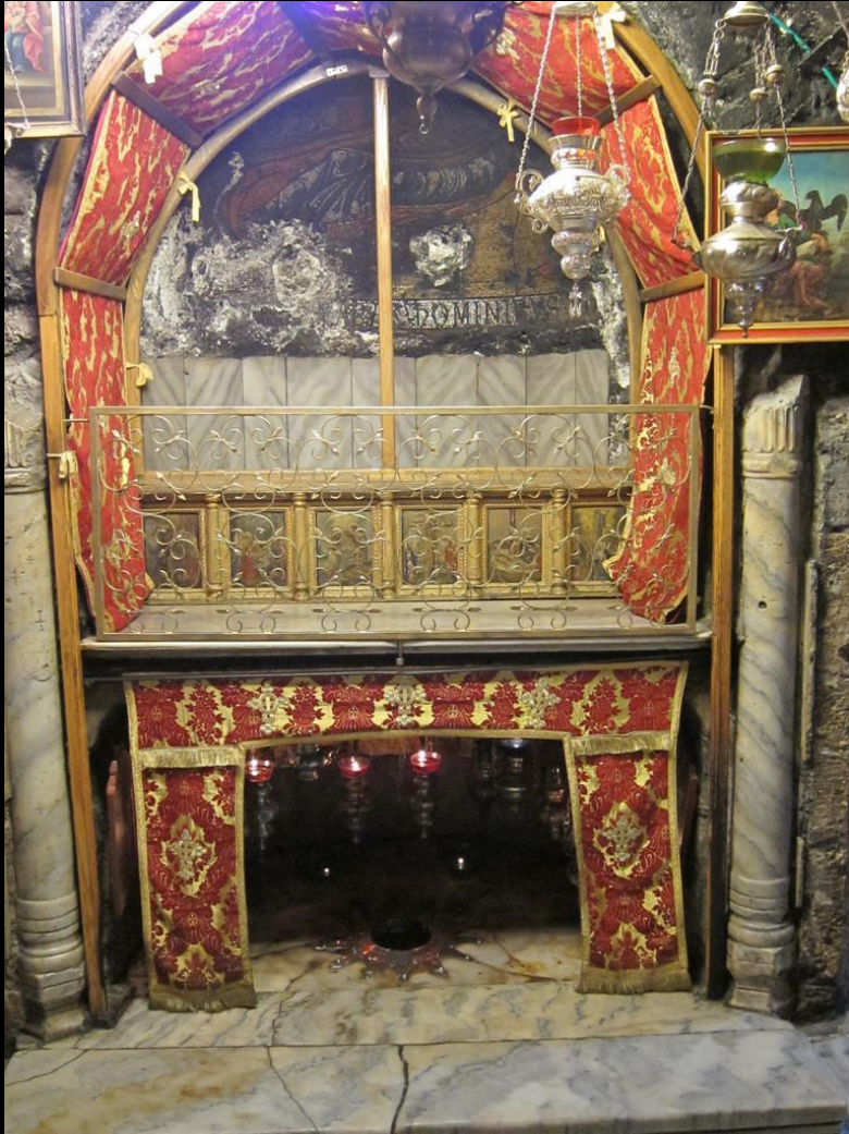
Bethlehem - Church of the Nativity - grotto - altar of the birth of Jesus.