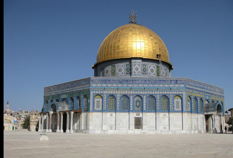
Jerusalem - Haram ash-Sharif - Dome of the Rock -facing northwest.