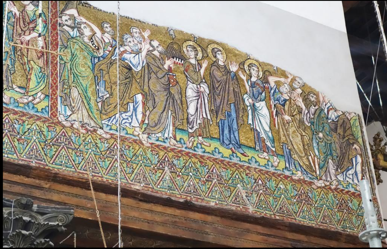
Bethlehem - Church of the Nativity - wall mosaics. Andres Reyes/Manar al-Athar [ID 97159]