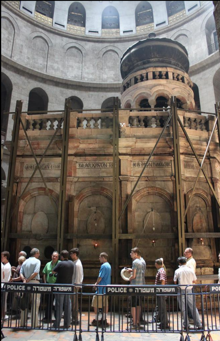
Jerusalem - Church of the Holy Sepulchre - tomb of Christ - facing south. [ID 72723]