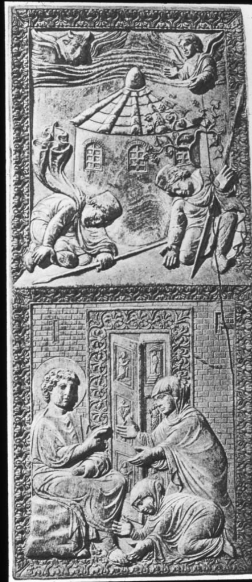
Milan – Trivulci ivory.