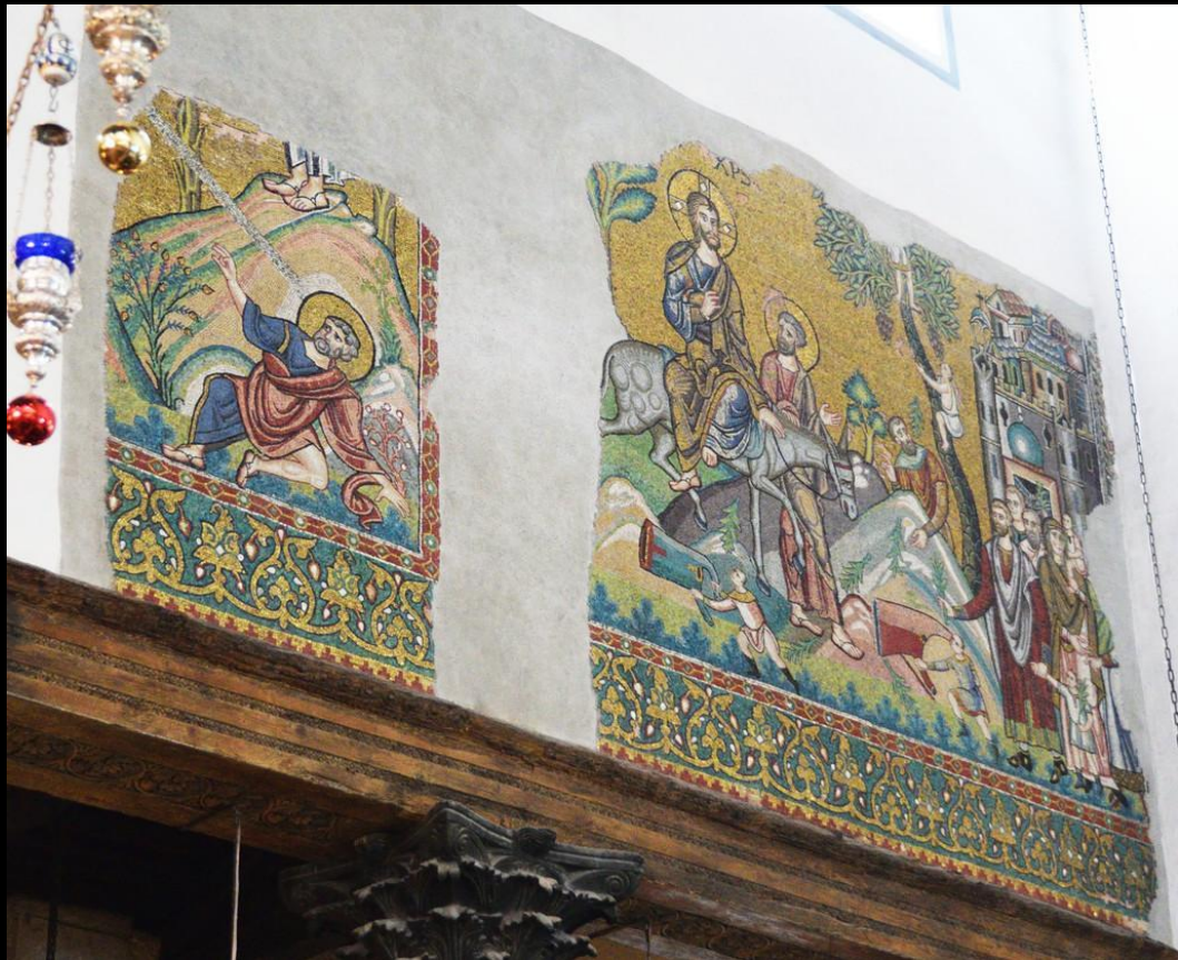
Bethlehem - Church of the Nativity - wall mosaics. [ID 97160]