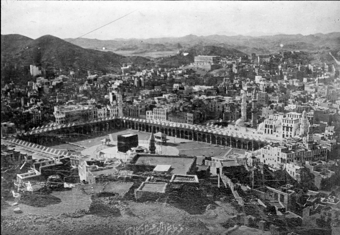
Mecca, The Ka'ba.