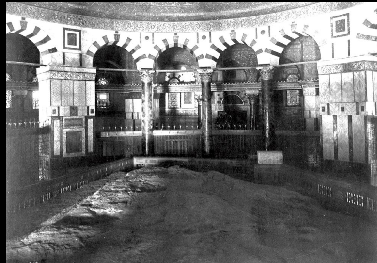
Dome of the Rock – interior.