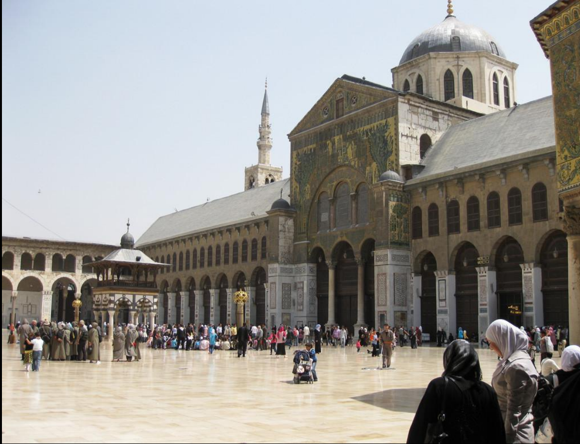
Damascus - Umayyad (Great) Mosque.