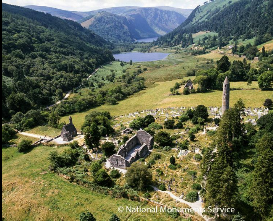
Monastic Ireland. "Glendalough."