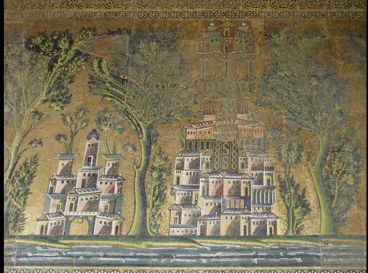
Damascus - Umayyad (Great) Mosque - west arcade. [ID 21851]